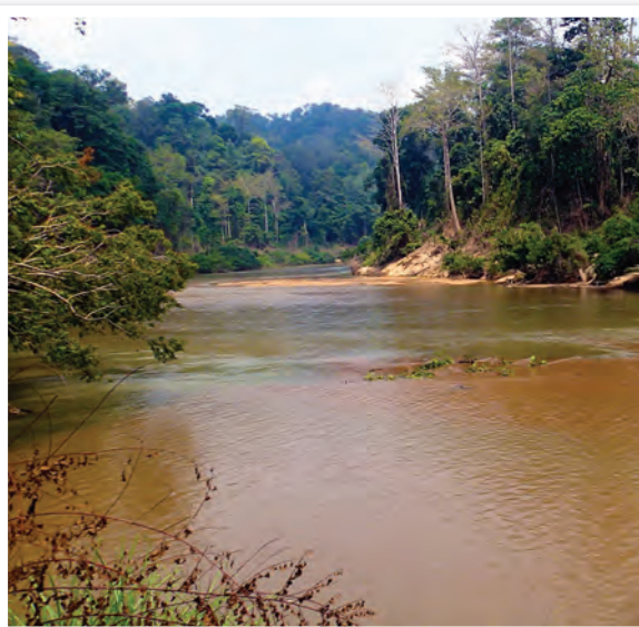
Sungai Tekai, Pahang Tekai River, Pahang

Disumbangkan oleh Bahagian Pengurusan Hutan Contributed by Forest Management Division