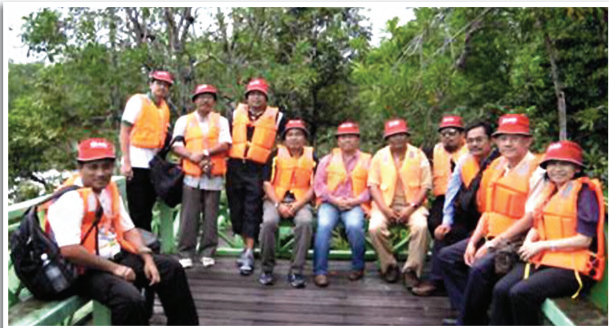
Ahli Jawatankuasa Kerja dan Pemandu Tanah Gambut Peringkat Negeri dan Kebangsaan National and State Working and Steering Committees on Peatlands

As a follow-up action, the AMS also formulated the ASEAN Peatland Management Strategy (APMS), specially developed to provide a common framework for peatland management in the region for the period 2006-2020. The APMS is a detailed and complex document comprising ASEAN regional objectives with 13 Focal Areas, 25 Operational Objectives and 85 Actions. Following the development of the APMS, each AMS has been tasked to develop its own National Action Plan for Peatlands (NAPP) to assist and align their national priorities into actions. In this context, Malaysia being one of the earliest amongst the AMS, has the NAPP endorsed in May 2011 and further amplified with its implementation of the ASEAN Peatland Forests Project (APFP) 2010-2014.