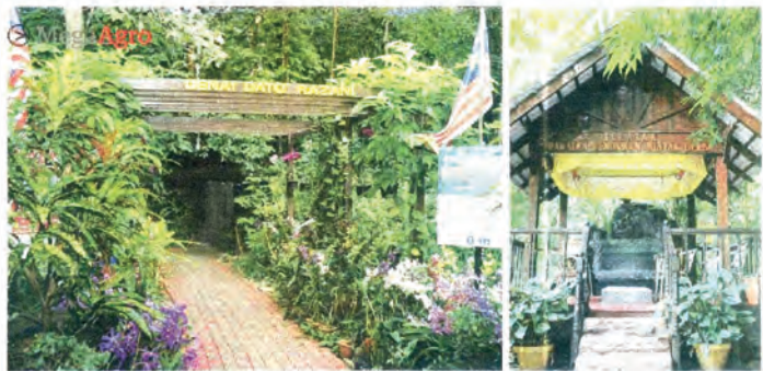
ANTARA herba-hutan di Herba Perlis ialah Denai Gaur (kayu hitam) dan Teratai Rambutan (kayu hitam).