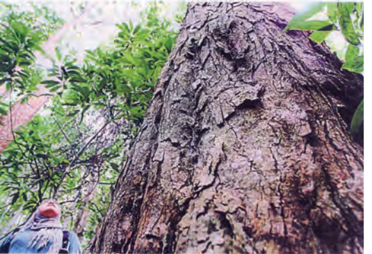
Unique spot: The Teak-Batik forest in Lumut, Perak, harbours numerous species of forest trees.

So when news surfaced that Vale Malaysia Minerals had purchased the Teak-Batik forest for the construction of an iron ore processing facility, alarm bells were triggered - and not just among botanists. The Teak-Batik forest, also known