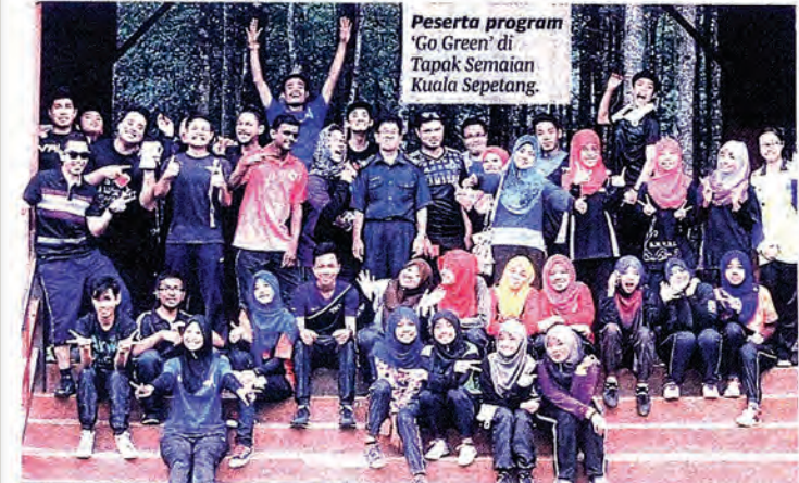
Peserta program 'Go Green' di Tapak Semaian Kuala Sepetang.