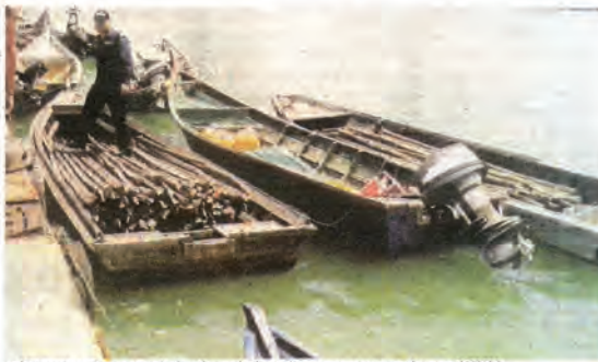
BOT yang cuba menyeludup kayu bakau dirampas penguat kuasa APMM.