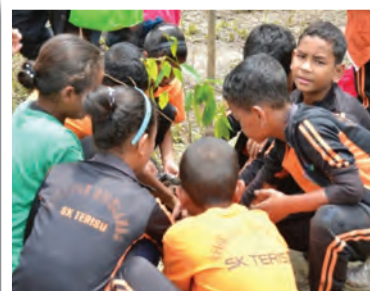
Murid-murid sekolah yang terlibat dalam aktiviti penanaman pokok School children involved in tree planting activity