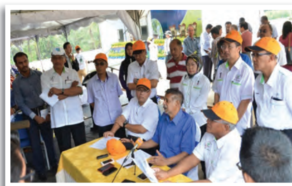
Press conference diantara wartawan dan Menteri NRE Press conference with the Minister of NRE

Following a Cabinet decision made on 12 July 2013, the Centralised Enforcement Team (CET) aimed to coordinate enforcement activities at Cameron Highlands was established, especially to tackle issues related to illegal opening of the forest through integrated enforcement activity involving various state and federal departments/agencies. In its efforts to further coordinate and streamlining the information, NRE has established the 1 NRE Command Centre (1 NCC) at Cameron Highlands. 1 NCC consists of the monitoring team by Department of Environment (DOE), Forestry Department Peninsular Malaysia (FDPM), Pahang State Forestry Department (Pahang SFD) and Department of Irrigation and Drainage (DID).