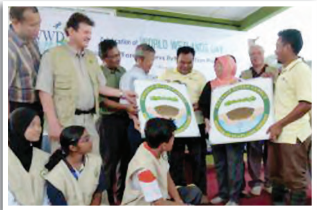
Penyertaan komuniti dan syarikat swasta dalam pengurusan tanah gambut secara berkesan Community and private company participation in the effective management of peatlands