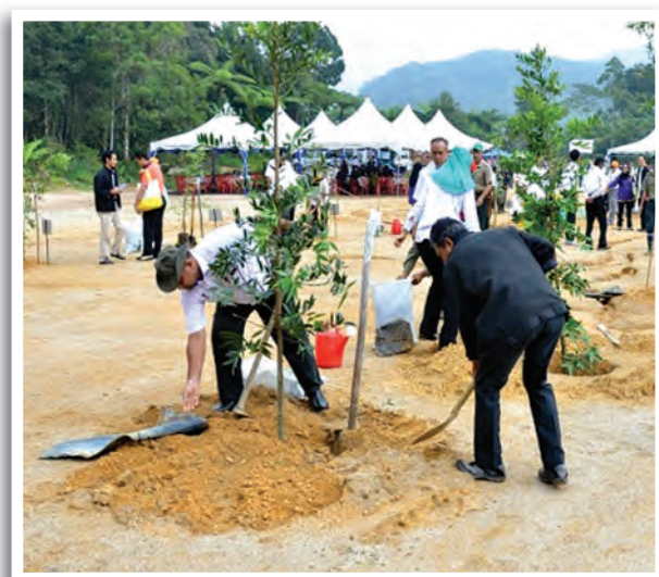
Aktiviti penanaman pokok Tree planting activity

Bagi aktiviti penghijauan kawasan Cameron Highlands, pihak NRE dengan kerjasama JPSM, JPN Pahang, JAS dan jabatan-jabatan lain di bawah NRE telah melancarkan Program Kerjasama Strategik Penanaman Pokok di Cameron Highlands. Majlis ini dirasmikan oleh YB Datuk Seri G. Palanivel, Menteri Sumber Asli dan Alam Sekitar bertempat di Hutan Simpan Terla B pada 30 September 2014. Program Kerjasama Strategik ini dilaksanakan di bawah tanggungjawab sosial beberapa rakan kerjasama NRE iaitu TESCO, PLUS, TNB, ASMA, GESB, K.S.S.B dan PETRONAS di empat (4) buah HSK dengan keluasan 26.0 hektar. Kos penyediaan anak pokok, kerja penanaman dan penyelenggaraan selepas tanam bagi tempoh lima (5) tahun akan dibiayai oleh rakan kerjasama NRE tersebut. Sebagai permulaan, aktiviti penanaman pokok di kawasan Cameron Highlands ini melibatkan empat (4) spesies pokok hutan iaitu Damar Minyak ( Agathis borneensis ), Rhu Bukit ( Gymnostoma sumathranum ), Podo Kebal Musang Gunung ( Nageia walliana ) dan Meranti Bukit ( Shorea platyclados ). Keempat-empat spesies pokok tersebut dipilih kerana ia sesuai hidup di dalam ekosistem pergunungan dan mampu mencapai tumbesaran yang optimum. Selain itu, pokok-pokok ini juga mempunyai komposisi yang tinggi di kawasan hutan dipterokarpa atas iaitu pada ketinggian 750 – 1,500 meter dari aras laut.