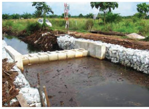
Program pemuliharaan paya gambut Peatlands rehabilitation programme