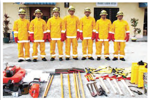
Skuad pemadam kebakaran hutan Forest fire suppression squad

Projek ini telah mendapat bantuan kewangan daripada Tabung Pembangunan Pertanian Antarabangsa (IFAD) dan Global Environment Facility (GEF). Menteri Sumber Asli dan Alam Sekitar Malaysia (NRE) merupakan National Focal Point, manakala Jabatan Perhutanan Semenanjung Malaysia (JPSM) adalah Agensi Pelaksana Projek Kebangsaan yang menyelaraskan pelaksanaannya. Sekretariat ASEAN pula ialah Ketua Projek APFP dan Global Environment Centre (GEC) adalah Agensi Pelaksana Projek Serantau yang berpusat di Malaysia.