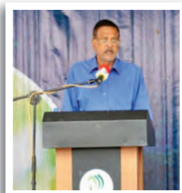
Majlis Perasmian Program Kerjasama Strategik Penanaman Pokok di Cameron Highlands oleh Menteri NRE Strategic Collaboration Program on Tree Planting Launching Ceremony at Cameron Highlands by Minister of NRE

Susulan daripada keputusan Jemaah Menteri pada 12 Julai 2013, Centralised Enforcement Team (CET) telah ditubuhkan bertujuan menyelaraskan aktiviti-aktiviti penguatkuasaan di Cameron Highlands, khususnya dalam menangani isu penerokaan hutan secara haram melalui aktiviti penguatkuasaan secara bersepadu yang melibatkan pelbagai jabatan/agensi persekutuan dan negeri. Dalam usaha untuk meningkatkan lagi koordinasi dan penyelarasan maklumat, NRE telah menubuhkan 1 NRE Command Centre (1 NCC) di Cameron Highlands. Ianya terdiri daripada satu pasukan pemantau yang dianggotai oleh Jabatan Alam Sekitar (JAS), Jabatan Perhutanan Semenanjung Malaysia (JPSM), Jabatan Perhutanan Negeri Pahang (JPN Pahang) dan Jabatan Pengairan dan Saliran (JPS) yang akan melaksanakan aktiviti rondaan darat dan pemantauan udara secara berkala dan sistematik.