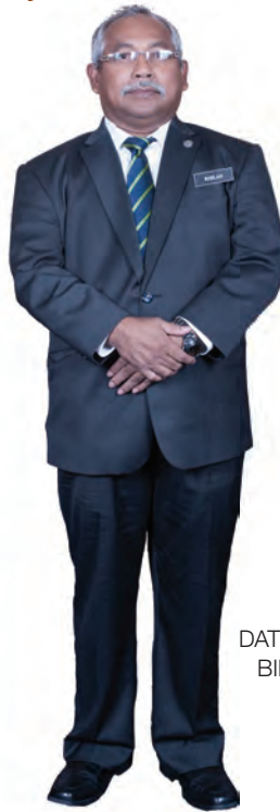
PERAK DATO' ROSLAN BIN ARIFFIN