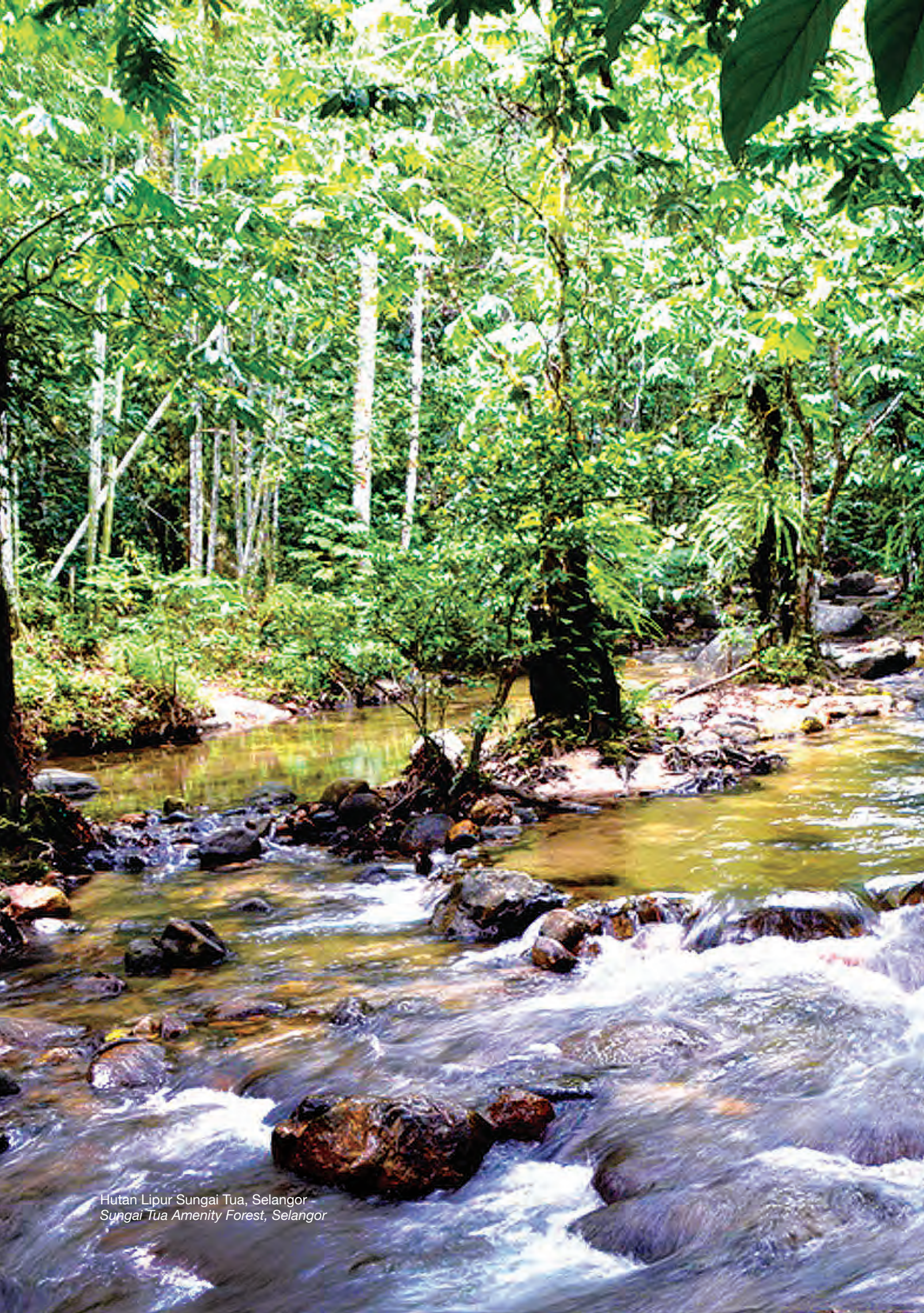
Hutan Lipur Sungai Tua, Selangor Sungai Tua Amenity Forest, Selangor