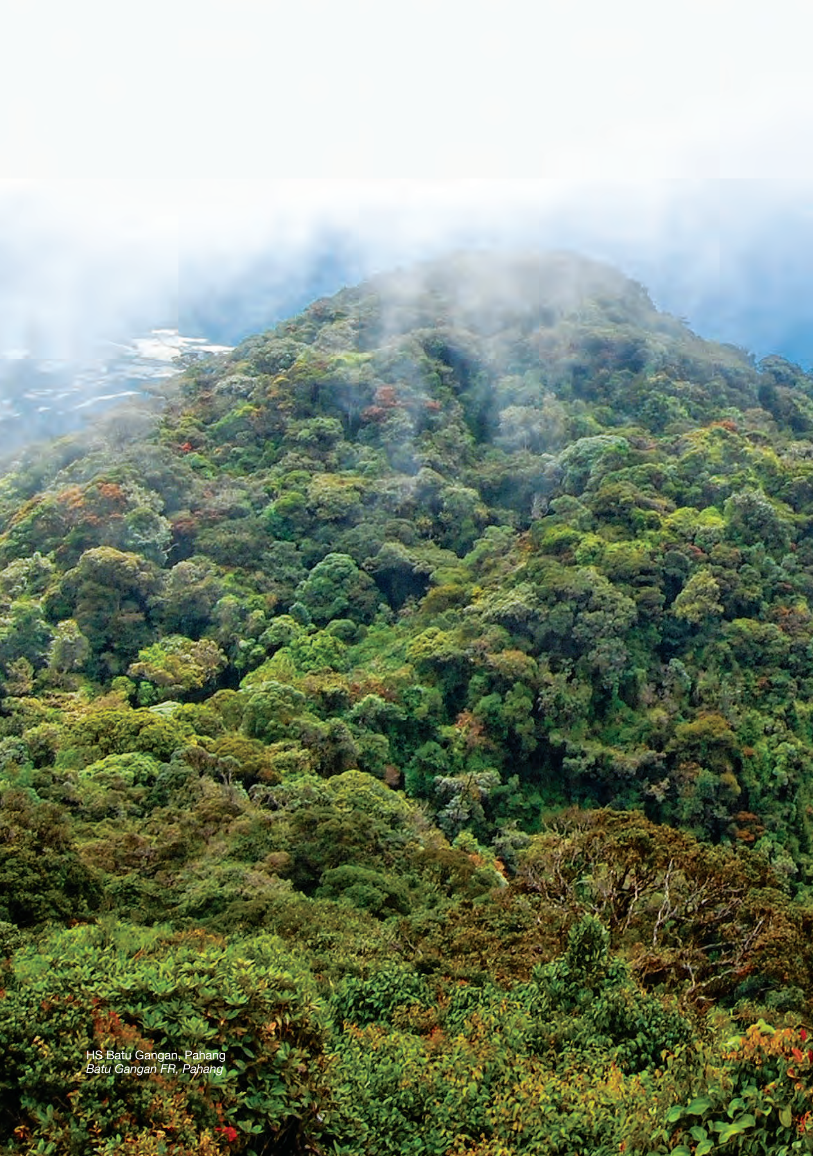
HS Batu Gangan, Pahang Batu Gangan FR, Pahang