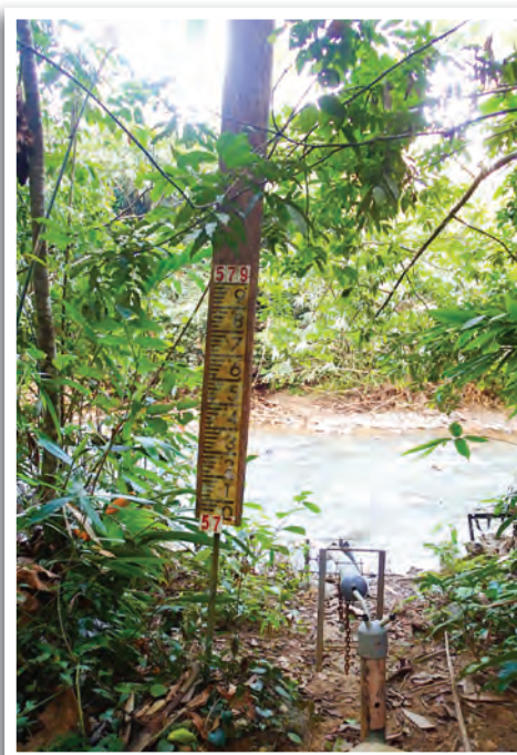
Peralatan Hidrologi yang dipasang di Stesen Tetap Hidrologi Sungai Salor, Hutan Simpan Temenggor, Grik, Perak The installed hydrological equipment at Sungai Salor Permanent Hydrological Station, Temenggor Forest Reserve, Grik, Perak

In relation to this, JPSM has established nine (9) Permanent Hydrological Stations; five (5) in Pahang, and one (1) each in Johor, Kedah, Perak and Terengganu. Through observation at these stations, it is found out that the river water qualities are at class II and III (with reference to Water Quality Classification and Use, developed by DOE as in Table 1). It means that forestry activities especially timber production activities have no significant negative impacts towards river water.