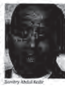
Dr Zambry Abdul Kadir

Kerajaan Persekutuan meluluskan hampir 5,000 hektar hutan di lima kawasan untuk diwartakan sebagai Hutan Simpan Bahal (HSB) sehingga 30 Oktober lalu. Kawasan berkenaan ialah Hutan Simpan Lektor, Hutan Simpan Kelip-Kelip, Hutan Simpan Peta, Hutan Simpan Tok Muhib dan Hutan Simpan Tintu Busoh.