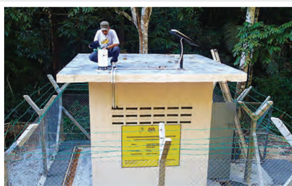
Stesen Tetap Hidrologi Sungai Sok, Hutan Simpan Ulu Muda, Kedah Sungai Sok Permanent Hydrological Station, Ulu Muda Forest Reserve, Kedah